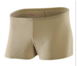
Color Arena Desierto