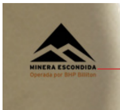
Logotipo Minería Escondida Estampado 7cmx1,5cm