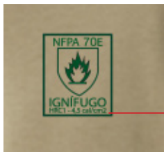
Logotipo Ignifugo HRC1 - 4,5cal/cm2 Estampado 5cmx4cm