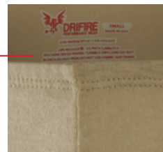
Etiqueta - Composición tela Estampado 5cmx4cm